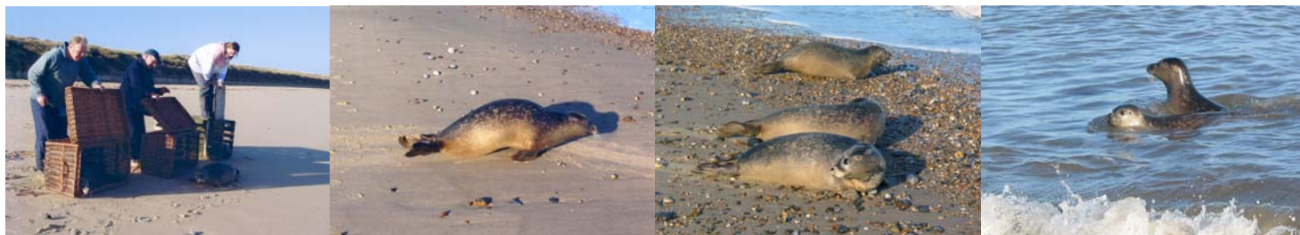
David, Harry, Sue and Jill releasing three seal cubs back into the wild

Once rehabilitated, all seals are released back into the wild, it makes a special day although we all have mixed feelings, sad to say goodbye but also really pleased and excited for the seals. On release days we know it is a job very well done.