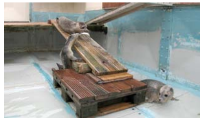
Ness, Frisky and Darius in the updated aqua pool

Our new refurbished aqua pool has been designed to encourage seal cubs to haul in and out of the water whilst learning to swim and catch their fish in the water. This has made a big improvement to their learning environment.