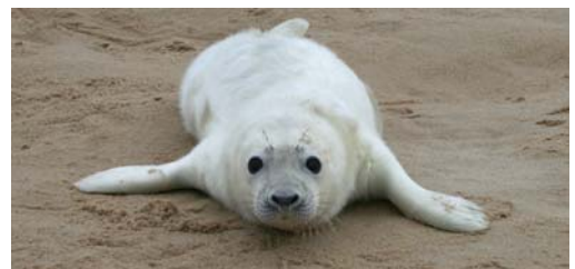
"A picture of a new born grey seal pup at the Winterton seal haul-out"

20cms white fluffy baby seal toy for £5.95 including postage and packaging.