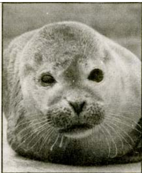
SAVED: Rocky one of the five week old Harbour seal pups rescued and currently being cared at Winterton Seal Hospital.

We would like to welcome you to our Autumn and Winter 2007/08 newsletter, as usual, we have had a busy season, but have continued to improve our facilities with your help here at the Winterton Hospital, so now we can do even more for our local seals. We still need money and volunteers to provide a permanent rescue centre with modern treatment facilities to care for the increasing number of injured and sick seals that are appearing on our shores.